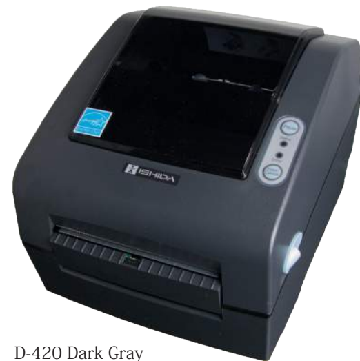
D-420 Dark Gray