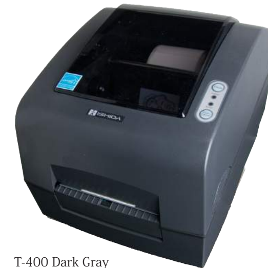
T-400 Dark Gray